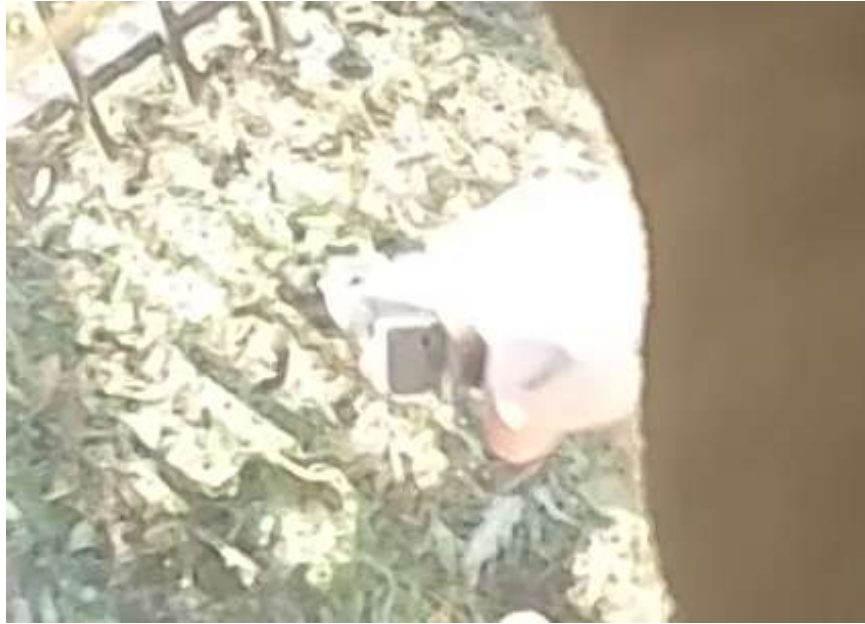
Photo of the firearm in the male's hand, captured from the officer's body worn camera

A second officer arrived to assist. The male then produced a pistol which he held in his right hand. During the altercation, the male was able to manipulate the firearm's slide, chambering a live round.