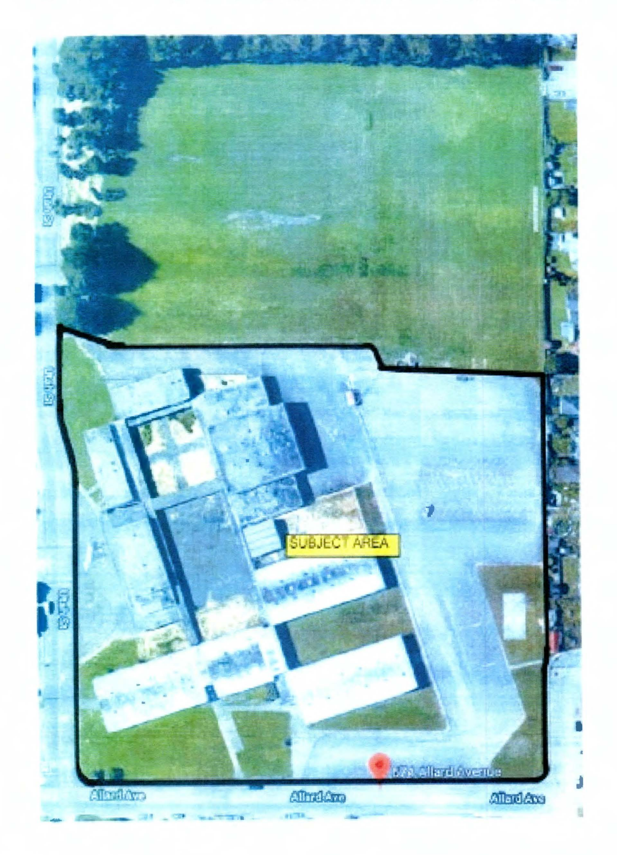
EXHIBIT A DEPICTION AND LEGAL DESCRIPTION OF DISTRICT EXCHANGE PROPERTY