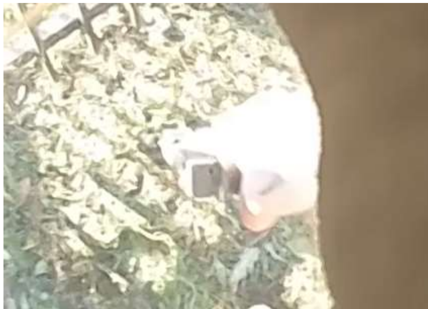
Photo of the firearm in the male's hand, captured from the officer's body worn camera

A second officer arrived to assist. The male then produced a pistol which he held in his right hand. During the altercation, the male was able to manipulate the firearm's slide, chambering a live round.